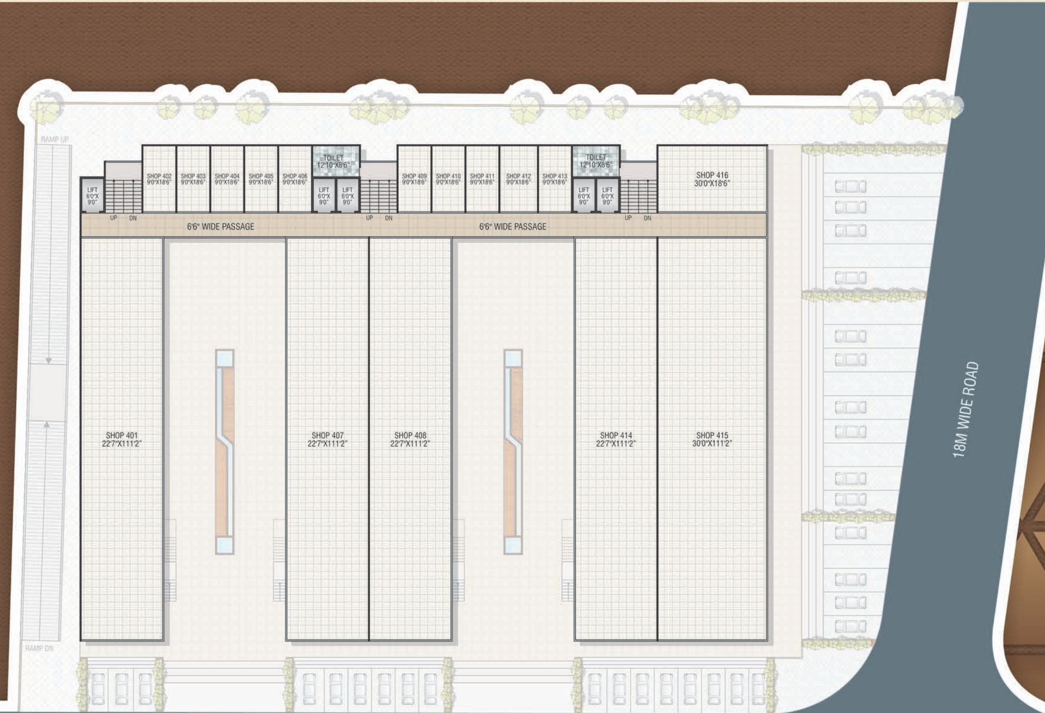
18M WIDE ROAD