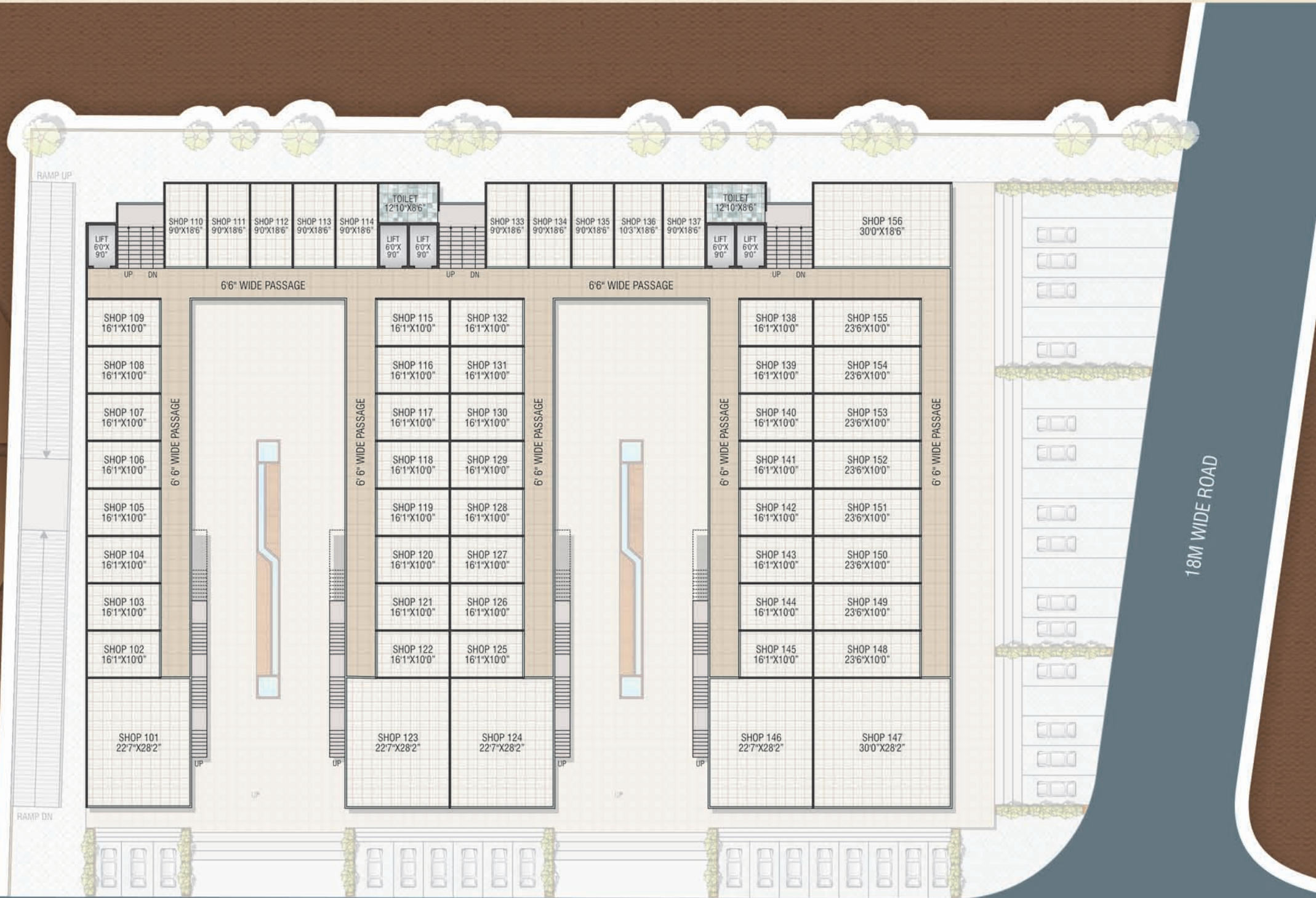
18M WIDE ROAD